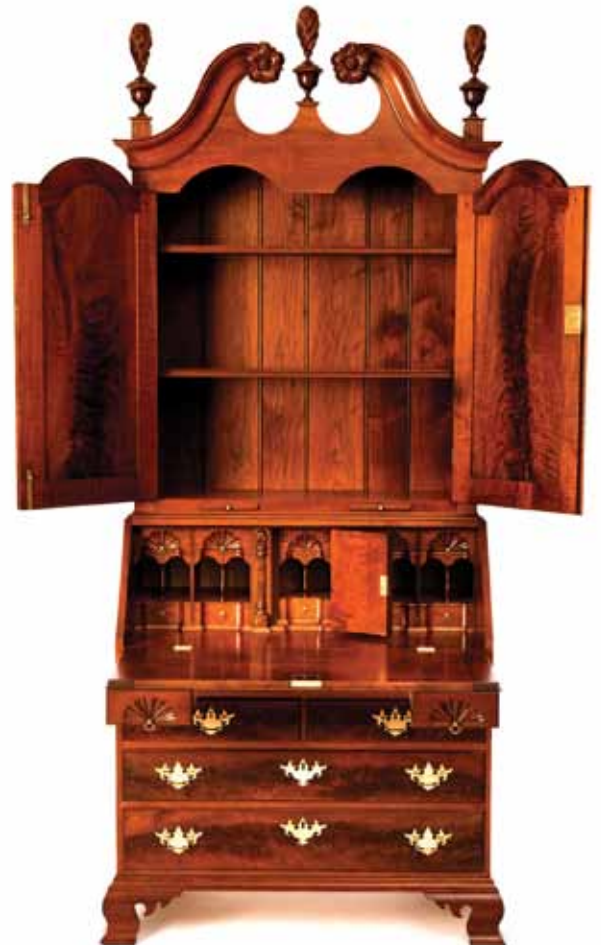
❧ CHIPPENDALE DESK AND BOOKCASE details Walnut with poplar November 2009